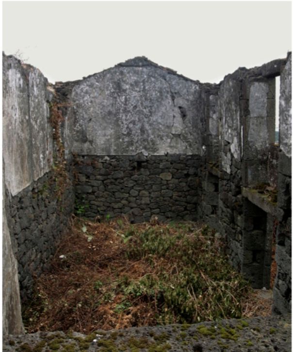
View towards interior of the ruin - 2005

The project is a movement between a limit line, in stone and concrete, and the volumes that are led by that same line, but sometimes flow independently or extend, whenever the necessity of space, light or of a view is needed.