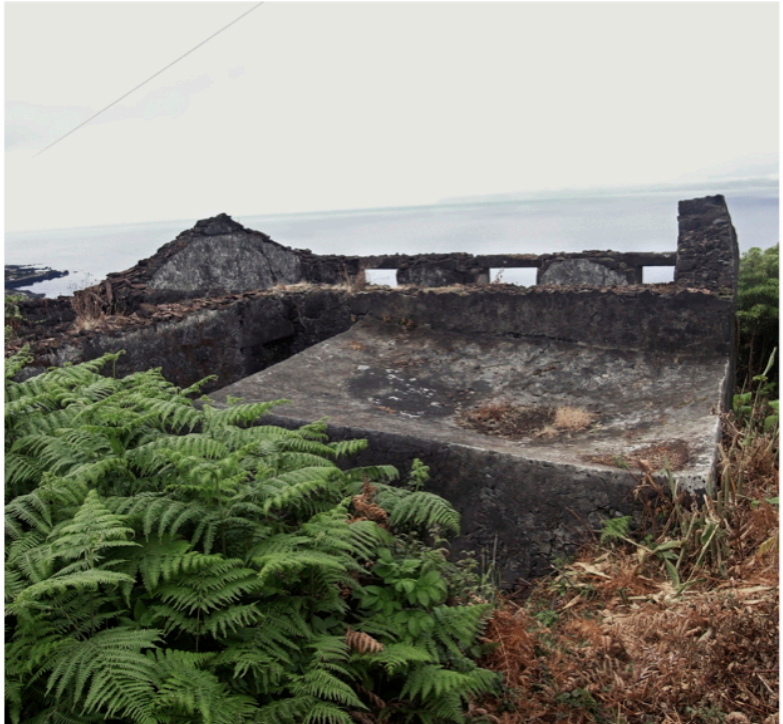
View towards the ruin - 2005