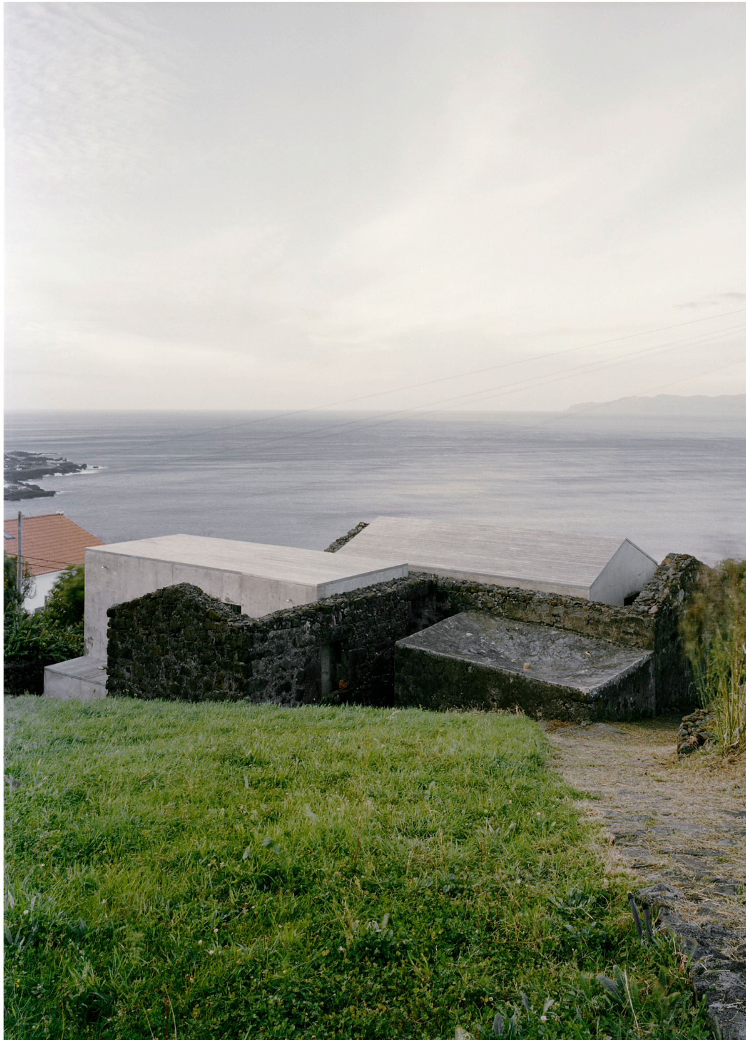
View from the South - 2014